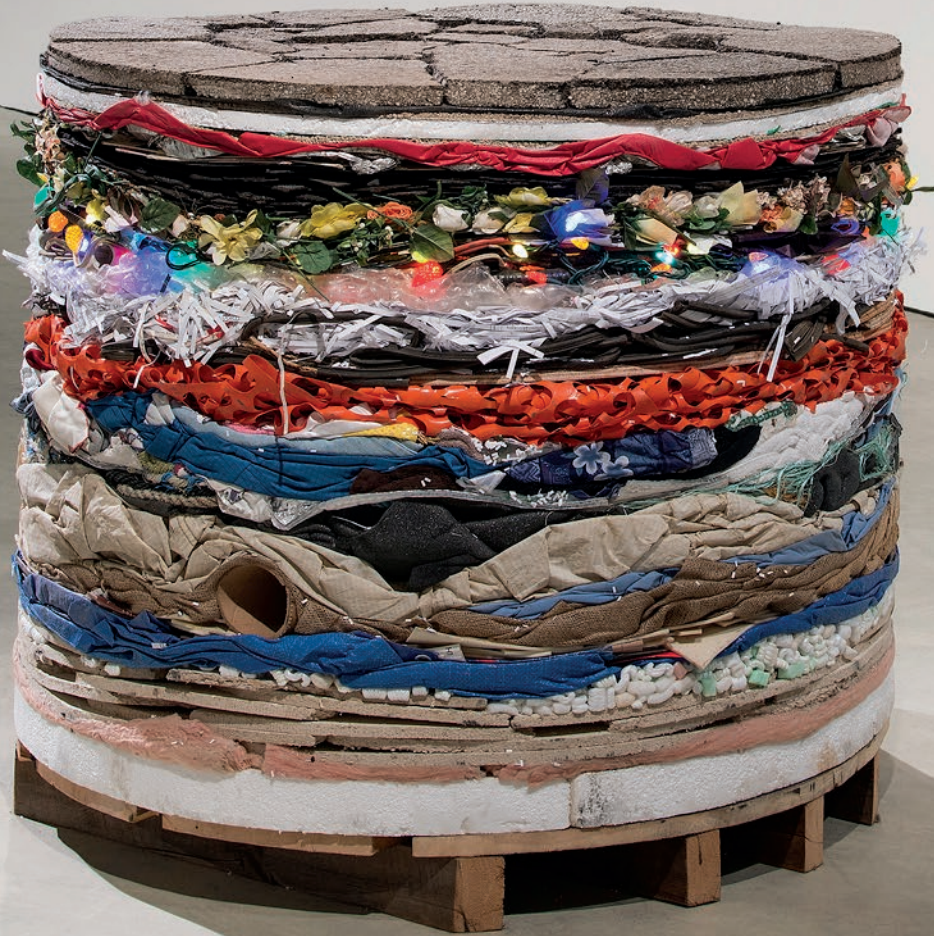
TH&B: Core Sample, 2014, mixed media, photo: Frank Piccolo